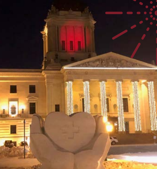
Red lights lit up on the Manitoba legislature building in honour of MMIWG on February 14th, 2020 – The Annual MMIWG March/Walk

The broader engagement plan is essential to ensure an aligned and effective path forward, and is intended to capitalize on Manitoba's strong, dedicated and vibrant networks who continue to work to put an end to violence against Indigenous women and girls. The engagement process is ongoing, with over 40 community-based organizations having participated to date. Engagement with families and survivors continues and is being led by Indigenous organizations with funding support from the Manitoba government.